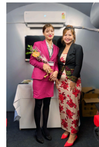
Chinchoikim chongloi NOVOTEL GUWAHATI